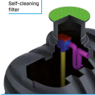
Inflow set (optional accessory)