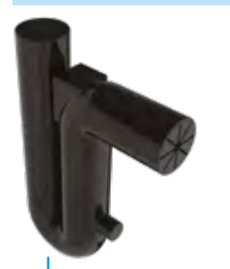
Overflow trap with rodent protection