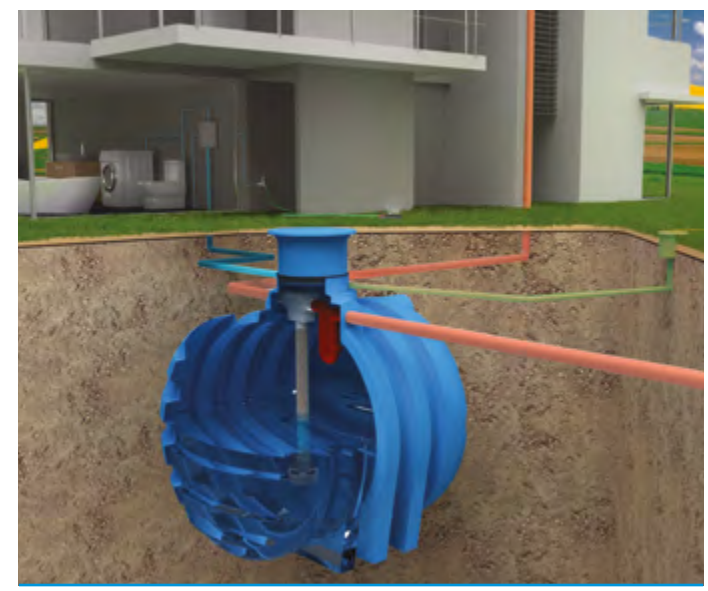
NEPTUN installed with inflow set